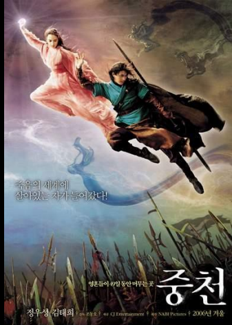
The Restless (Jo Dong-oh, 2006)