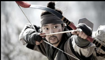
War of the Arrows (Kim Han-min, 2011)