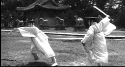
A Swordsman in the Twilight (Chung Chang-wha, 1967)