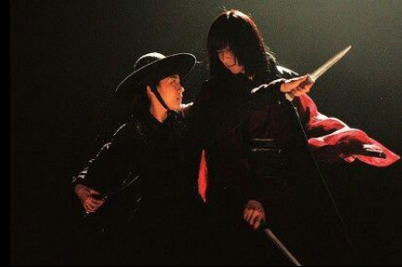
Duelist (Lee Myung-se, 2005)